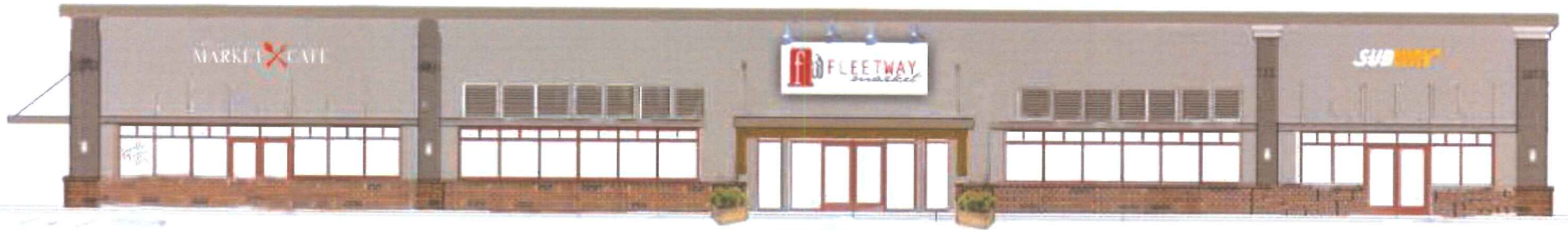
NORTH ELEVATION 1/4" = 1'-0"