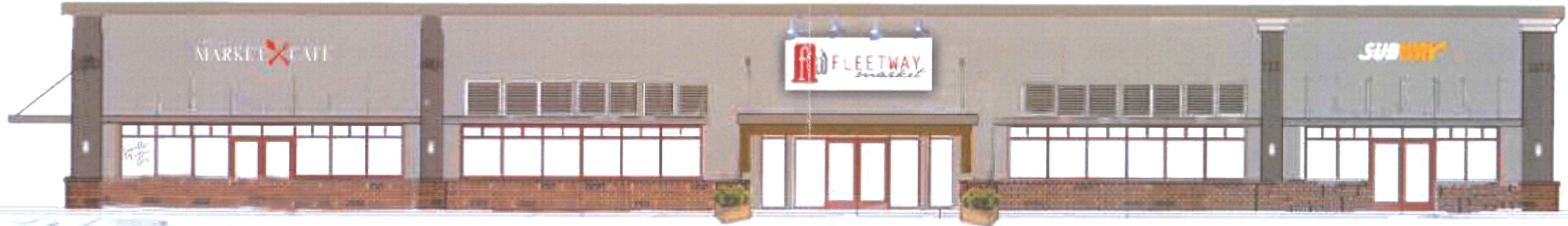
NORTH ELEVATION 1/4" = 1'-0"